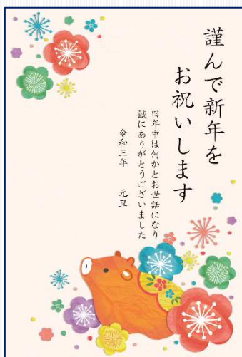
< back >

People send post cards as New Year's greetings in December. The cards sent by December 25th will be delivered on January 1st.