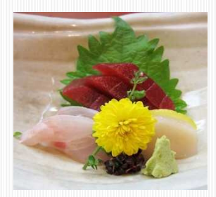
They go well with a cup of hot green tea. We are looking forward to Autumn coming.

They say that edible chrysanthemums contain a lot of vitamin and beta-carotene. However, excessive intake should be avoided.